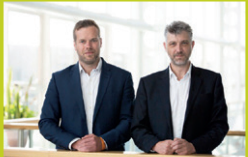
The founders of 4T2 Sensors based in Birmingham, West Midlands

This led to 4T2 designing an innovative sensor for simple integration into industrial process lines. Known as the ‘Diemetric Sensor’, it combines precise electronic sensing with advanced embedded algorithms to determine key properties of fluids in real-time.